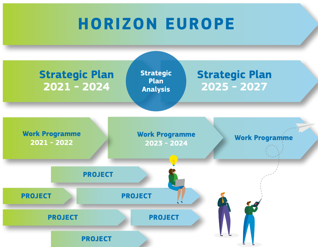
Figure 1 – Implementing Horizon Europe